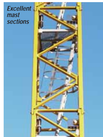
Excellent mast sections

instruction guide makes the building required very easy.