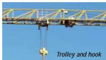
Trolley and hook

As befits the model it comes in a very large box over 1.1 metres long and this is because the model is supplied largely made up, with little assembly needed. It even has all of its reeving done, so this is an easy model for the non-expert and a clear