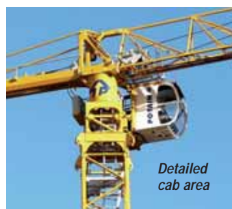
Detailed cab area

The operator's cab has opening doors and windscreen wipers on the windows. Electrical cabinets have realistic cabling which connects to the various motors and really enhances the quality feel of this model. The Potain MDT 178 has distinctive styling and the scale model copies this perfectly with the counter jib and counterweights being just like the original. The main jib is an excellent piece of model engineering being true and straight over its one metre length.