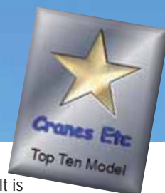
A model to look up to

A small metal key is provided with the model and this can be used to operate the hoist and the trolley mechanism. There is also a working service derrick and an operational concrete skip provides a load. The crane can be displayed at different heights up to 1.4m tall depending on the number of sections used in the mast. An optional climbing frame will be available for the crane soon and this will enhance the model further.