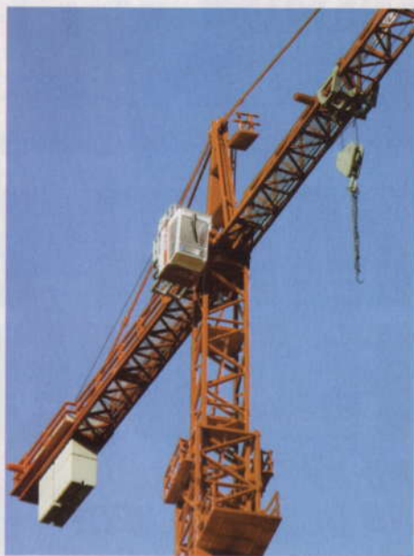
Above: The Wolff 7532 is a realistic-looking model.

Ros have provided the crane with a good level of functionality. It rotates well and the hook can be raised and lowered. Unusually, it also features a working trolley mechanism which is rare on this scale of tower crane. The crane is stable enough