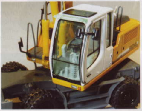
Above: The detailed cab interior of the Liebherr A924.