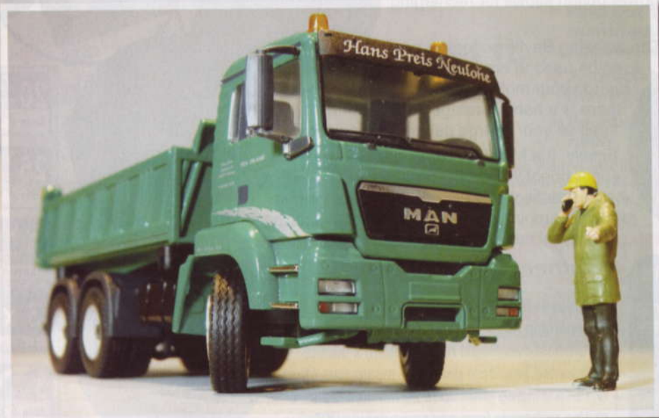
Above: The MAN TGS dumptruck model is a fine-looking piece of work.

Conrad of Germany has a long history of making construction-related vehicles and a recent release is the MAN TGS dumptruck which is coupled with a Goldhofer TU4 trailer. Although such a combination is rare in the UK, it does provide the flexibility of transporting a loader to a site so the dump truck can be immediately filled.