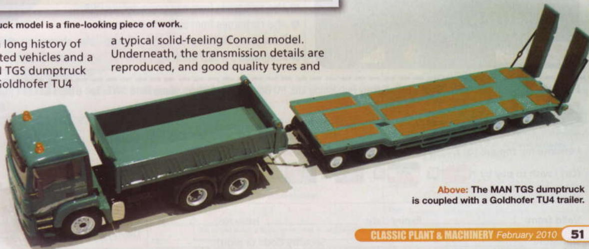
Above: The MAN TGS dumptruck is coupled with a Goldhofer TU4 trailer.