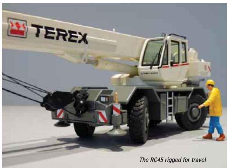
The RC45 rigged for travel