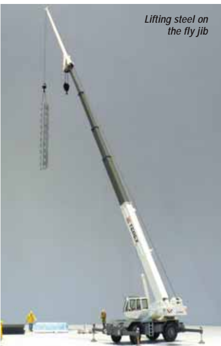
Lifting steel on the fly jib