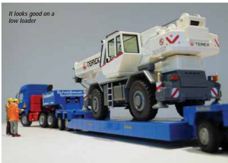
It looks good on a low loader