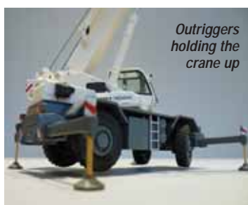
Outriggers holding the crane up