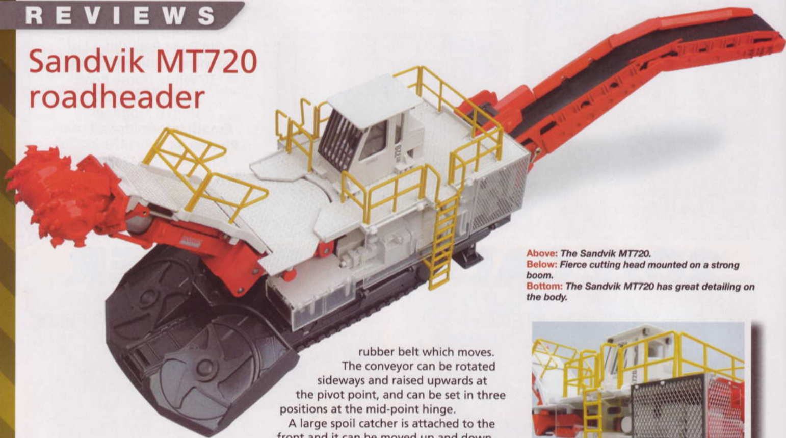
Above: The Sandvik MT720.