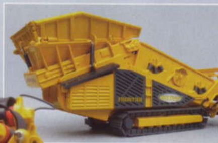
There is very nice detailing on the body.

Keestrack has commissioned an interesting model of one of its products and it is solid and well made. It can be displayed set up working or as a very good transport load on a suitable vehicle. The price is around £90 and to order it contact Keestrack at info@keestrack.net .