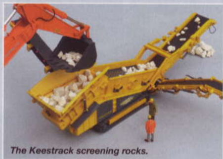
The Keestrack screening rocks.

Keestrack is a Belgian company which produces screening and crushing equipment and it has directly commissioned this 1:50 scale model of the Keestrack Frontier screener from a factory in China. The real machine has an output of around