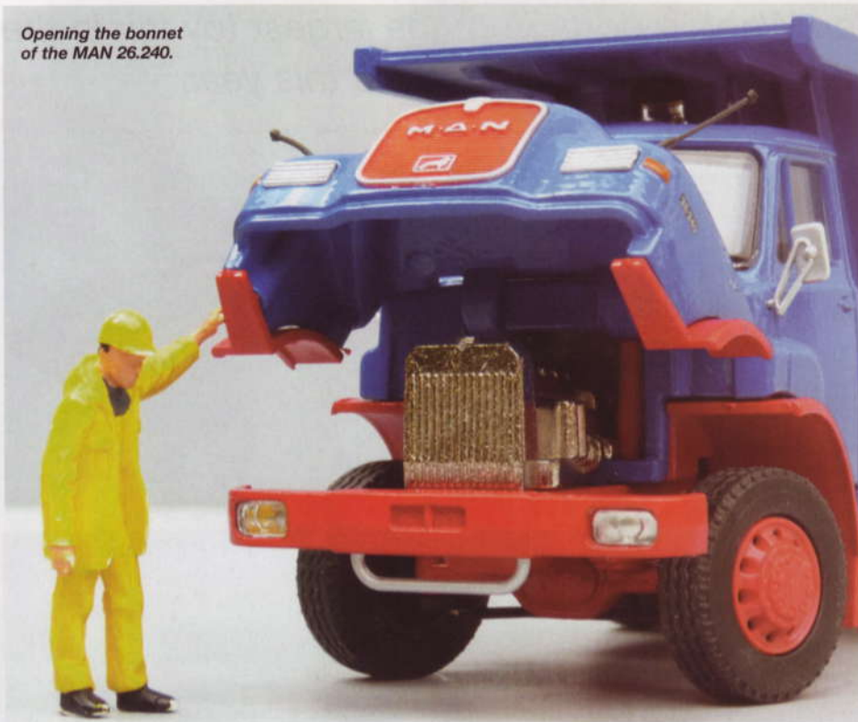
Opening the bonnet of the MAN 26.240.