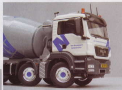
The nicely decorated MAN TGS cab.

This model has a quality feel due to its weight and very good paintwork and sharp graphics. It is a good-looking truck and is a limited edition model available for around £70.