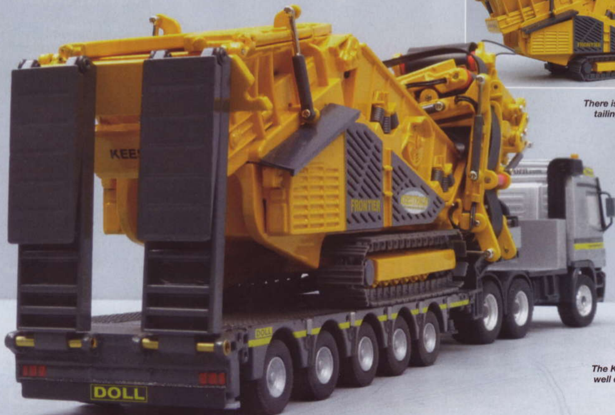
The Keestrack poses well on a low-loader.