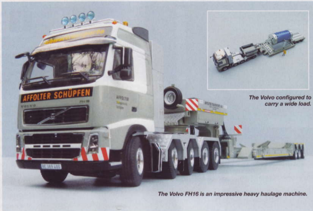
The Volvo configured to carry a wide load.