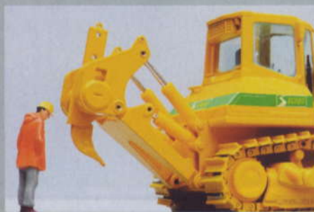
The Liebherr PR 754 pushes rocks.

The Liebherr has a fearsome-looking ripper.