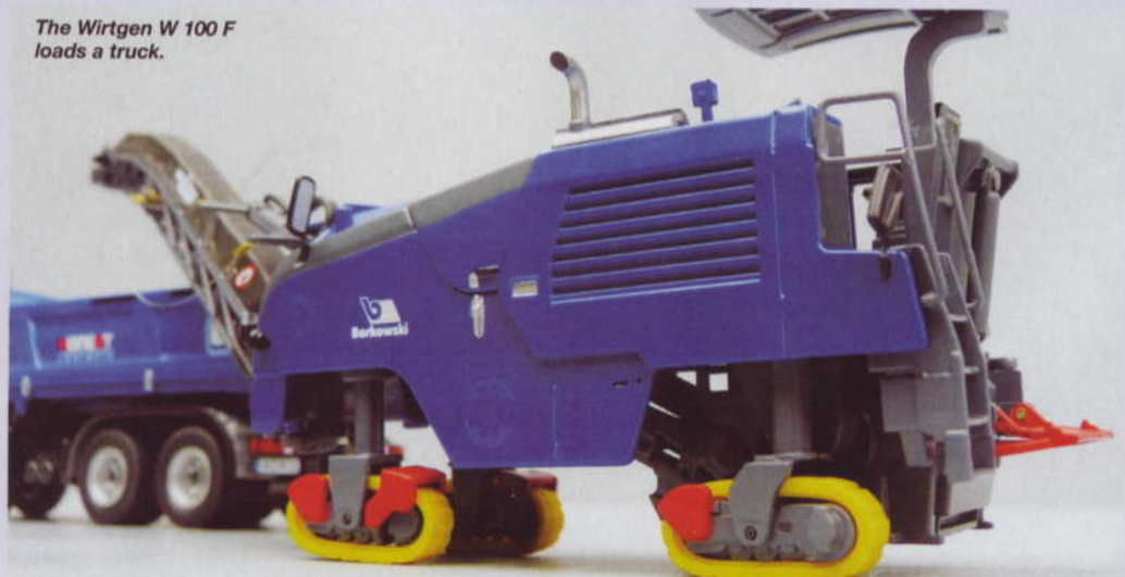
The Wirtgen W 100 F loads a truck.

model of a Wirtgen Group machine by NZG. The functionality is impressive and this limited edition has been made in a run of 300 models. It costs around £85 and is very good value.