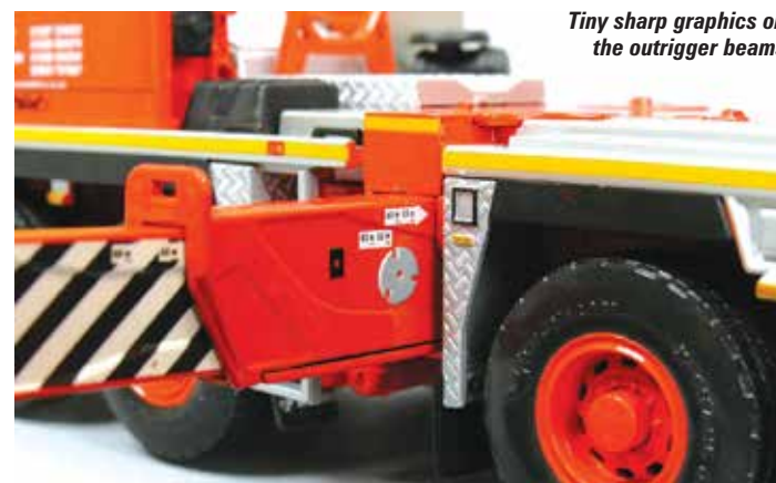
Tiny sharp graphics on the outrigger beams