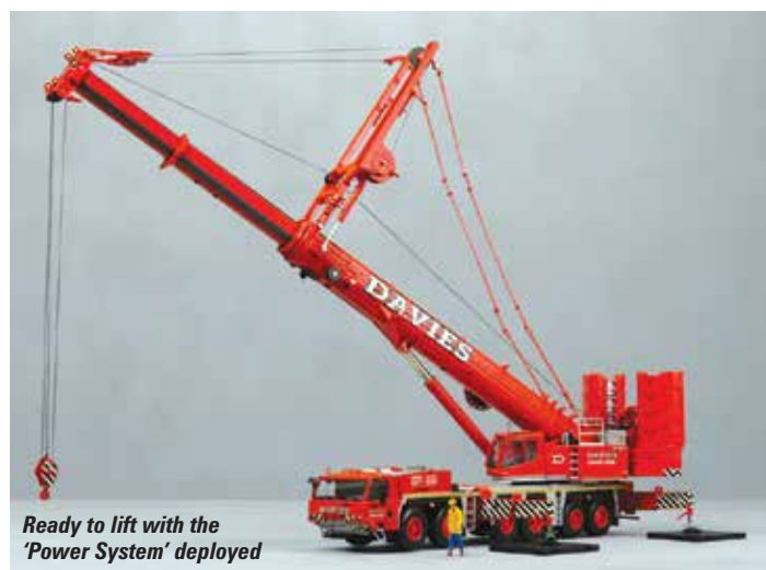
Ready to lift with the 'Power System' deployed