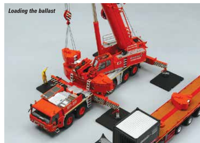
Loading the ballast