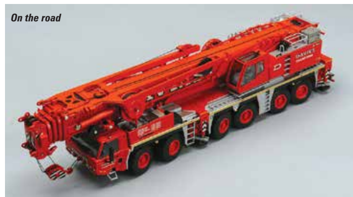
On the road