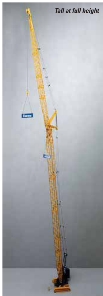
Tall at full height

The model is very detailed. The metal crawler tracks roll reasonably well, and the separate crawler assemblies can be used as transport loads. It also has working translifters.