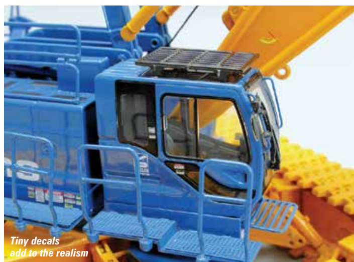
Tiny decals add to the realism