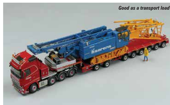
Good as a transport load