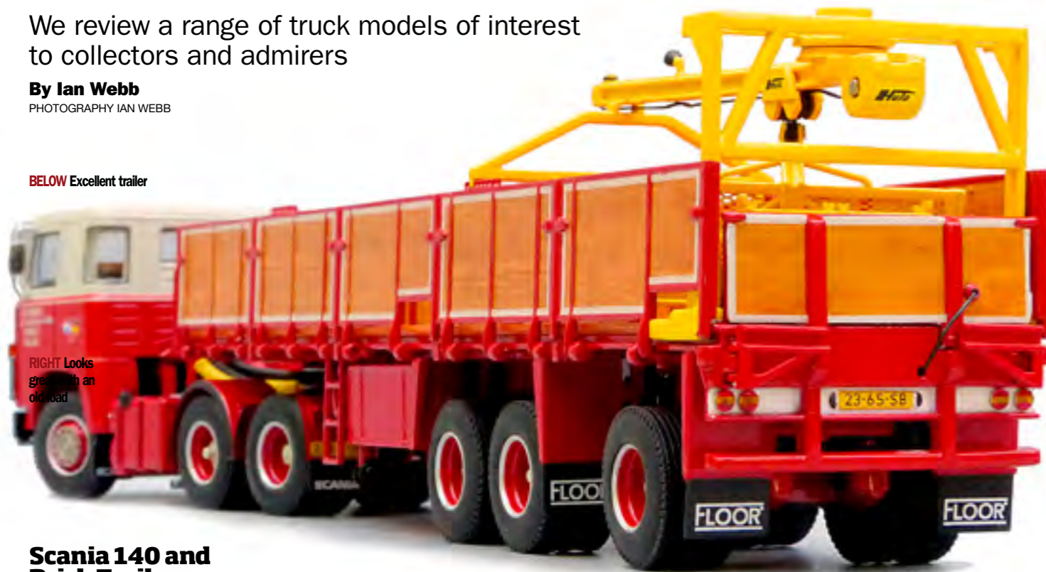
RIGHT Looks great with an old load