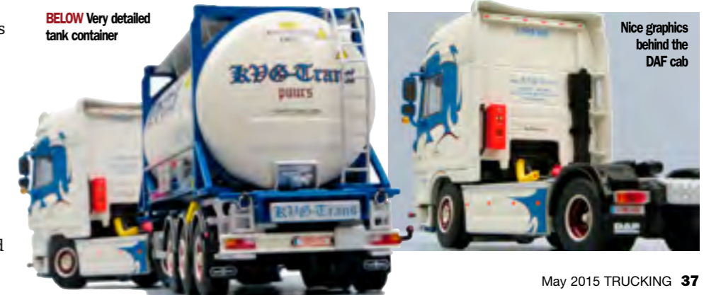
Nice graphics behind the DAF cab

Behind the cab there are coiled lines and diamond non-slip surfacing.