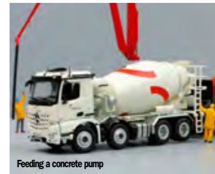
Feeding a concrete pump

smart in Holcim colours. The water tank and engine are moderately detailed, and at the rear the access ladder and platform hand rails are a little on the fat side for the scale. The metal discharge chute has full side-to-side movement.