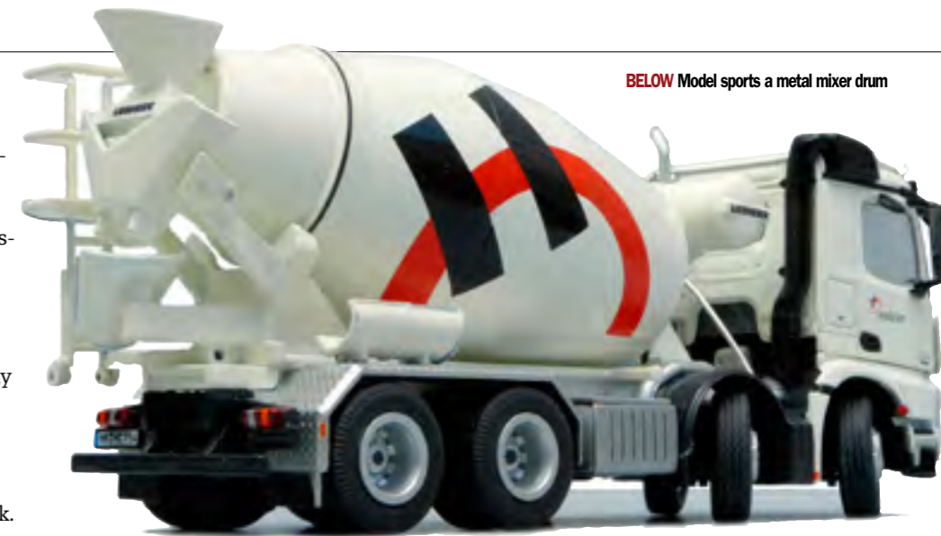
BELOW Model sports a metal mixer drum

Inside the cab, the seats have arm rests. Behind the cab, the exhaust and intakes are modelled in plastic, with the snaking perforated exhaust looking good. The wheel arches are metal throughout and the light bar at the rear has nice plastic lenses. The mixer drum is metal, rotates smoothly and looks