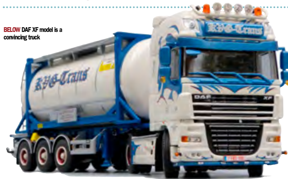
BELOW DAF XF model is a convincing truck