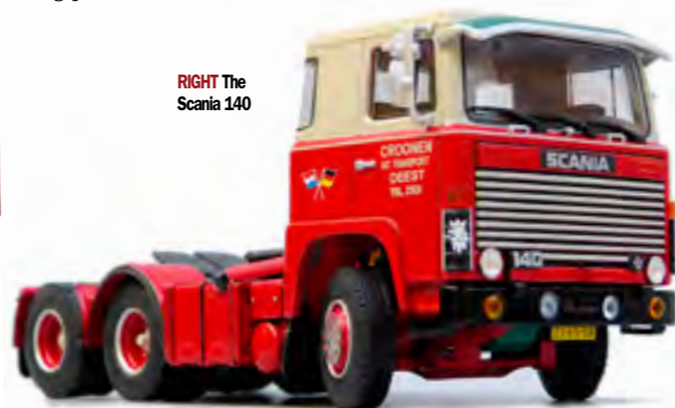
RIGHT The Scania 140