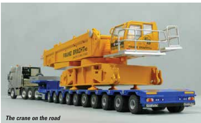
The crane on the road