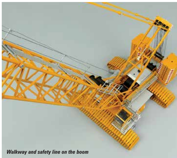
Walkway and safety line on the boom