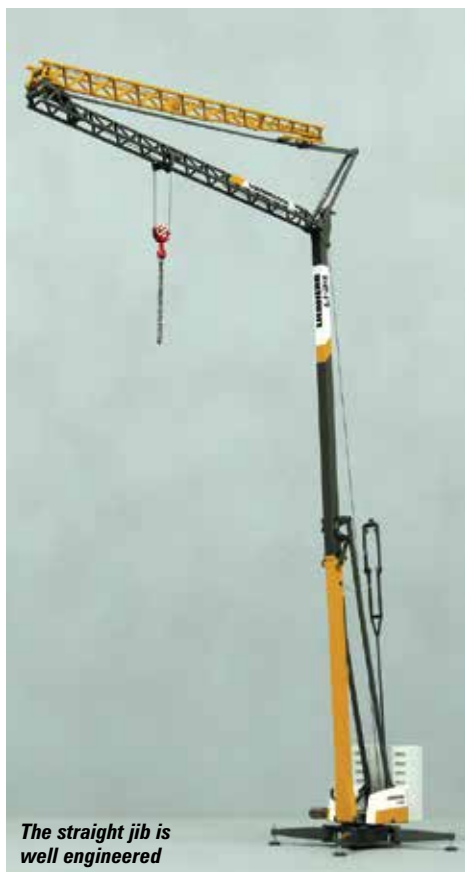
The straight jib is well engineered

The model can be displayed in folded mode with or without the ballast attached, but it is a pity that transport axles are not included. The erection sequence replicates that of the real crane and it works