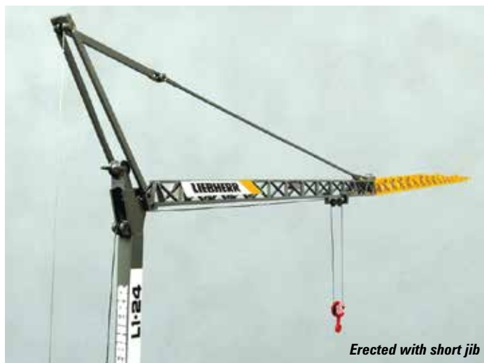
Erected with short jib