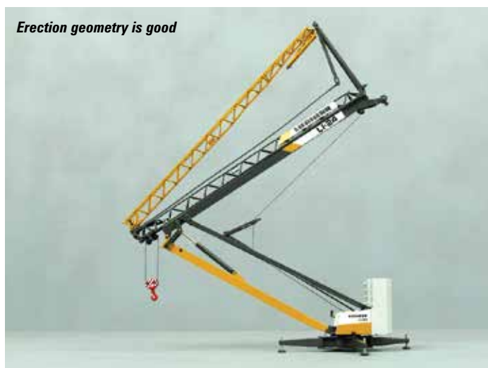
Erection geometry is good