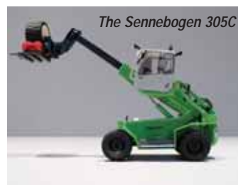
The Sennebogen 305C

To read the full review of these models visit www.cranesetc.co.uk