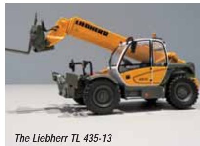
The Liebherr TL 435-13

a lifting height of just 7.3 metres. The model is also manufactured by Bami and in many respects has a similar level of detail to the Liebherr. The features are good with the steering being able to achieve a hard lock and the model replicates the interesting elevating cab mechanism of the original. It also comes with a bucket as well as forks and pallet, with the addition that the bucket has a trash grille.