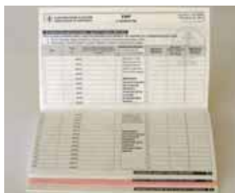
The daily log.

The books are available from the EWPA at a cost of A$10 (£4.80/€6.10) to members and A$15 (£7.20/€9.15) for non members. With 135 daily entry points for the pre use check, the logbook should normally last around six months, which in the UK will span the time between each Thorough Inspection.