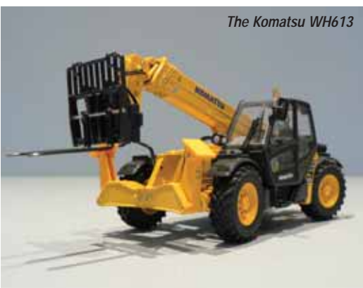
The Komatsu WH613

In comparing the three models, they each have facets to commend them. The Komatsu is the cheapest and yet has the most detail although the working parts are perhaps the least satisfactory.