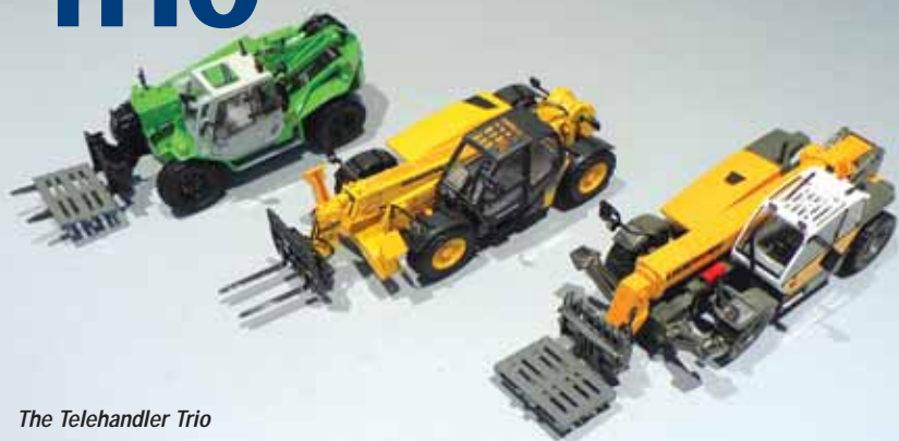
The Telehandler Trio

The 'standard' scale for construction models is 1:50, but for smaller machines such as telehandlers a larger scale is often used. For this month's review three 1:50 telehandler models have been chosen, the Komatsu WH613, the Liebherr TL 435-13 and the Sennebogen 305C.