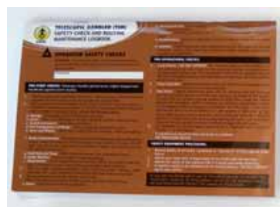
The telehandler log book.

The Association also produces a similar logbook for Telescopic Handlers although this is not yet available on waterproof paper although the cover is laminated. The sections are similar to the MEWP book, with a daily log of the routine inspections, a section for reporting faults and a routine service and repair log.