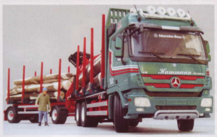
Above: Very nice paintwork on the truck.