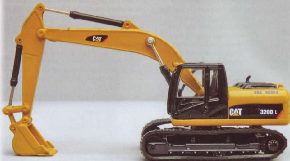
Above: The Caterpillar 320D L excavator.