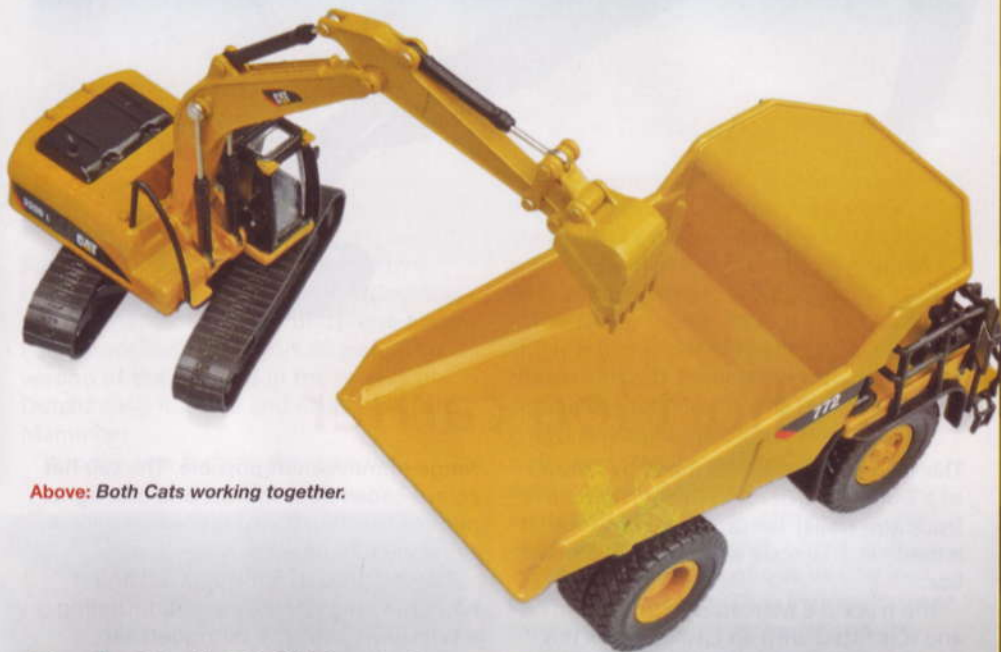
Above: Both Cats working together.