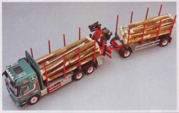
Above: The Doll log carrier.