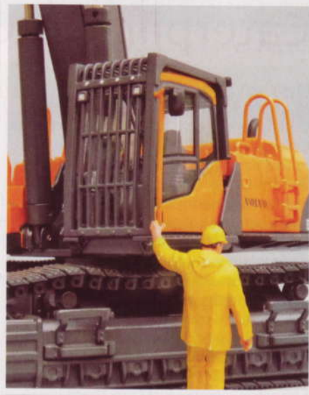
Above: Nice cab details.

The boom sections are metal and the hydraulic pipes and hoses are modelled