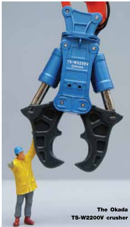
The Okada TS-W2200V crusher

their mountings by undoing a couple of bolts. A third version of the model is also available with a standard large digging bucket.