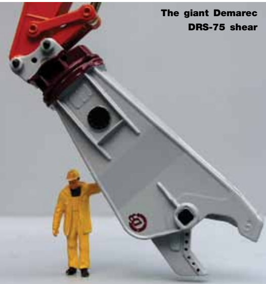
The giant Demarec DRS-75 shear

The two WSI models differ with the tools attached. One has a Demarec Multi-Quick Processor and the other has a huge Demarec DRS-75 Shear. Both are functional, being able to rotate on their mountings and opening and closing, and they can also be removed from