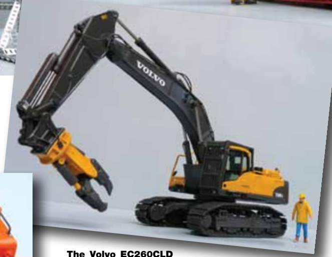
The Volvo EC260CLD