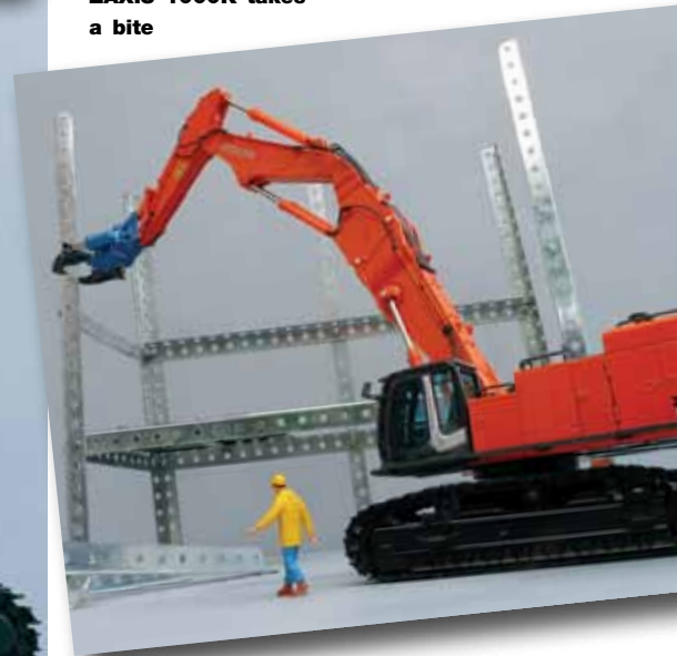
The smaller Hitachi ZAXIS 1000K takes a bite