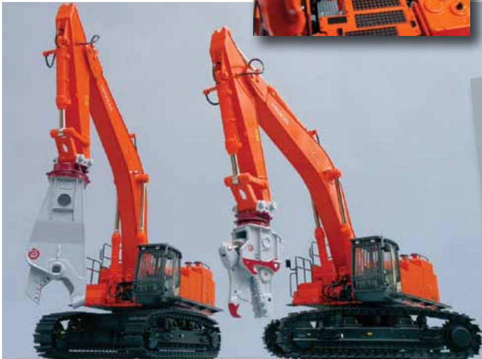
The two Hitachi ZAXIS 870 LCH-3 models

The EC700CHR is a big model with a boom that scales at over 30m. It is unusual in that it appears to have been directly commissioned by Volvo from China rather than through one of the established model makers. It has some good features not present on the other models reviewed here such as extendible tracks and