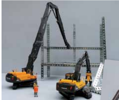
The two Volvo models at work