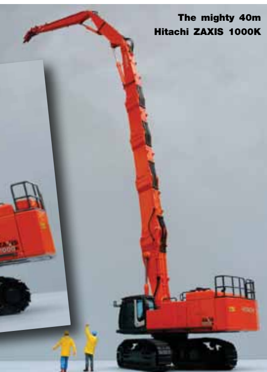
The mighty 40m Hitachi ZAXIS 1000K

The other four models are all Hitachi machines. Two are made by NZG and are of the ZAXIS 1000K, which is a machine Hitachi sells into the Japanese market. For the models the base machine is the same, but one has a short boom arrangement and the other has a scaled 40m high reach boom. The detail