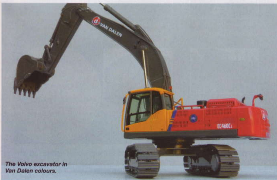
The Volvo excavator in Van Dalen colours.

The Volvo EC460CL excavator has an operating weight of around 50tonnes and this 1:50 scale version of the model by NZG is in the colours of Van Dalen, a Dutch company.