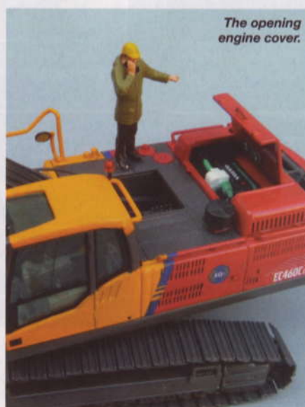
The opening engine cover.

The modelling of the hydraulics is very good with a detailed hydraulic unit at the