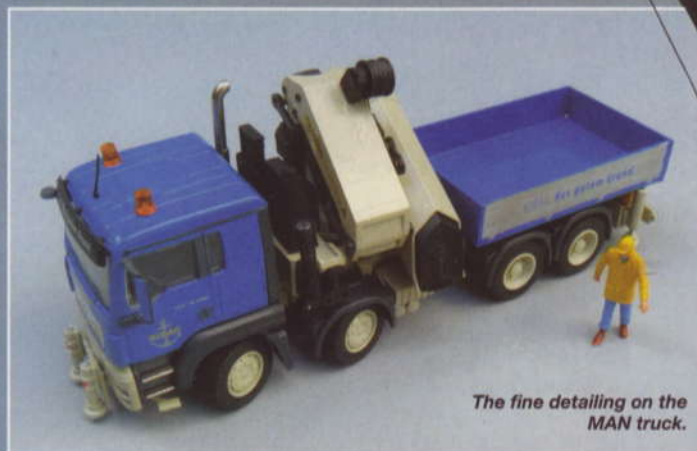
The fine detailing on the MAN truck.

This MAN truck has a large Palfinger PK100002 loading crane which is a machine in the 100-tonne class. It is in the colours of Kibag, a Swiss company, and this 1:50 scale model has been commissioned by Heavy Transport Models from Conrad.