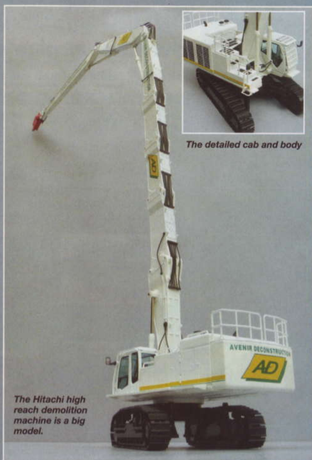
The detailed cab and body

This is a very nice quality model which is finished well in the Avenir livery and looks impressive because of its overall size. It is good value at around £160.