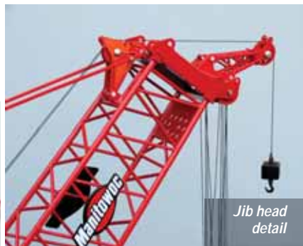
Jib head detail

An engine block is present inside the body and is complete with a rotating cooling fan inside a radiator assembly. The counterweight slabs are detailed with step irons and lifting lugs. The MAX-ER attachment provides additional counterweight on a wheeled carrier with large rubber tyres. The walkways and handrails are excellent and there is some very good hydraulic hosing detailed on the legs.