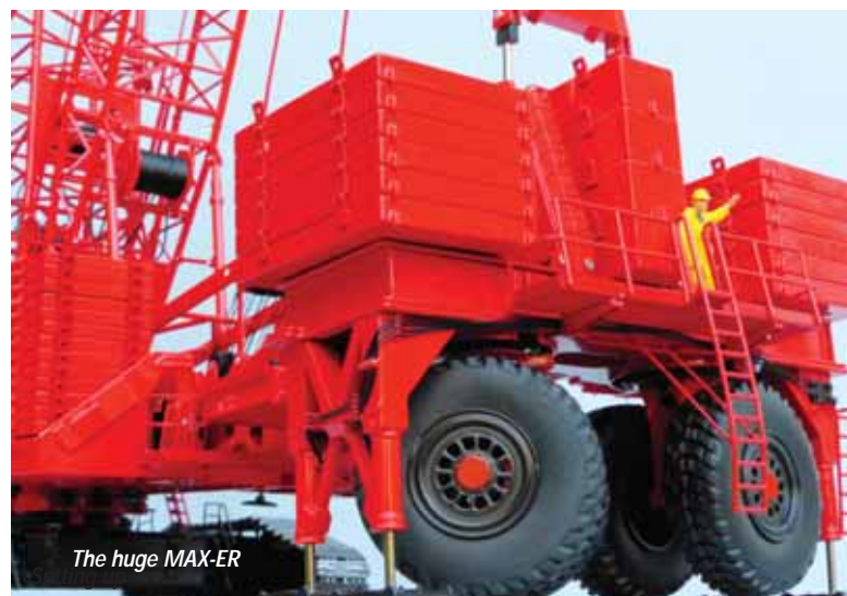
The huge MAX-ER