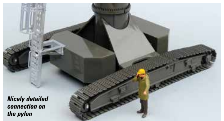
Nicely detailed connection on the pylon