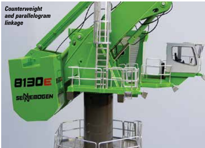
Counterweight and parallelogram linkage