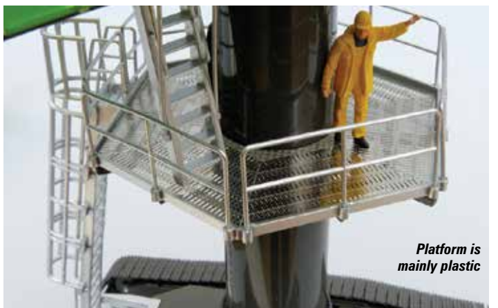
Platform is mainly plastic