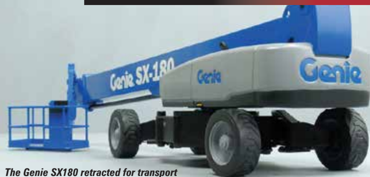
The Genie SX180 retracted for transport