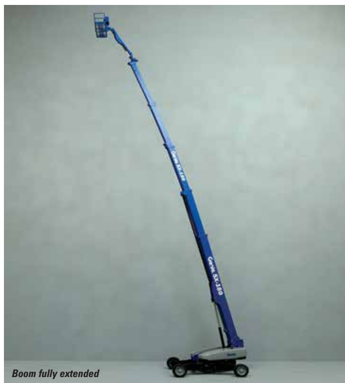
Boom fully extended