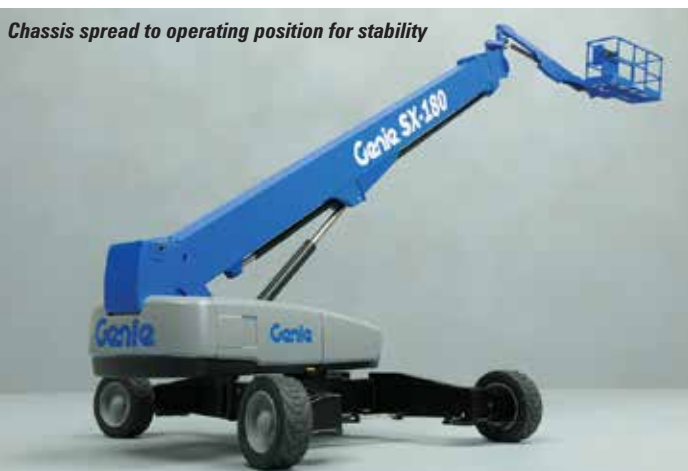
Chassis spread to operating position for stability