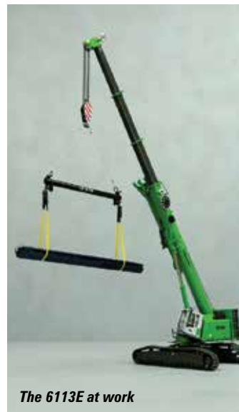
The 6113E at work