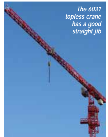
The 6031 topless crane has a good straight jib

Both the cabs on these models are of the same design and include windscreen wipers and a driver's seat. The hook blocks are metal and include tiny brass sheaves. Also included is a Wolffkran nameplate to hang from the hook.