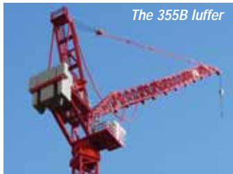
The 355B luffer

The German company Wolff was taken into private ownership in 2005 and since then has expanded and improved its range of tower cranes. Now four new scale models of Wolff tower cranes have been released in 1:87 scale manufactured by Ros of Italy. The range includes the company's smallest flat top crane, the 4517 city crane and the large 379t/m 7532 saddle jib unit, but the models we are reviewing here are its mid range 6031 Clear flat-top and its mid range luffer, the 28 tonne 355B.