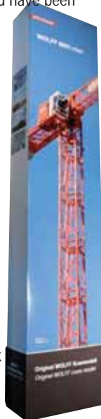
Detail on the climbing frame could be better