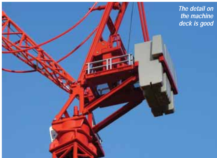
The detail on the machine deck is good

These are good models and we would certainly recommend to collectors. They would have been even better if the jib and mast had been able to be split into sections like the real thing so that different configurations could have been built. The 6031 costs 115, and the 355B 125 and they can be purchased from Wolff directly.