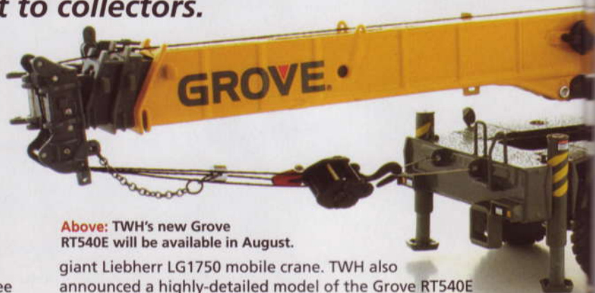
Above: TWH's new Grove RT540E will be available in August.

The Intermat exhibition in Paris is one of the major shows for full-size equipment. New models are often announced or available at these shows and Intermat saw a Mecalac and three Case models from Conrad, as well as a new version of Conrad's