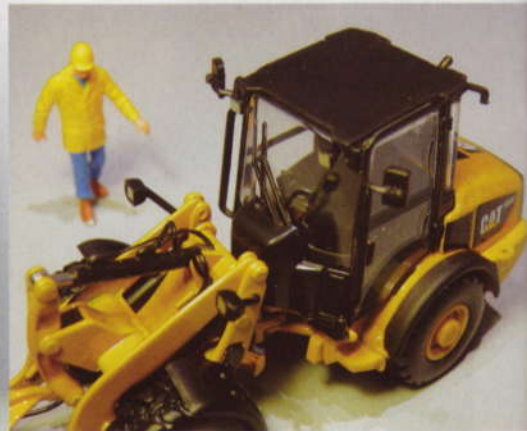
Above: Norscot have produced very good detail around the cab of the 906H.

Left: The CAT 906H is a very compact machine.