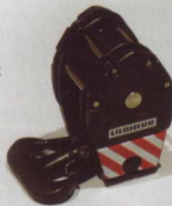
Below: YCC make hooks of all sizes.