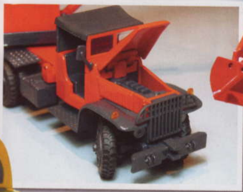
Above: The opening bonnet of the Poclair TP30 Excavator.

Poclair of France was the first company to develop a hydraulic excavator. This is an interesting model of an historic machine and forms part of the Poclair Heritage Collection.