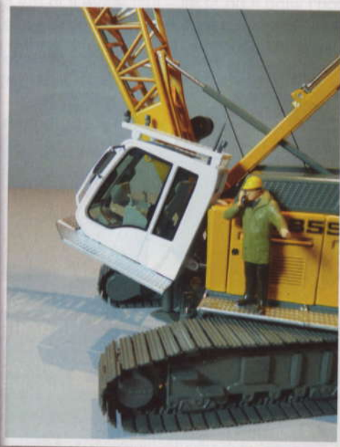
Above: Detailed cab.

All the crane functions are fully usable. The winches are operated using supplied tools and are accessed by opening doors