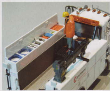
Above: Opening chests are full of equipment. Below: The Peterbilt 355.

This is new release by TWH Collectibles is a model of an American truck used by mechanics to service plant and machinery. The version reviewed here is in the colours of Manitowoc, which makes Grove and Potain cranes amongst others. It is also available in a number of other colours.