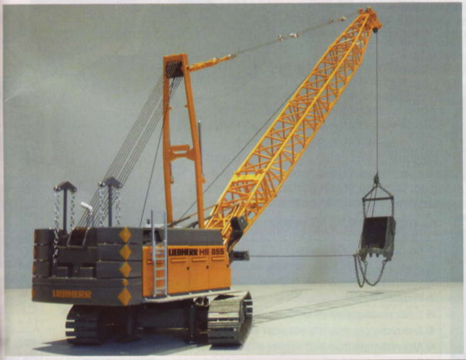
Above: The Liebherr HS855 HD rigged as a dragline.

This model is made by NZG and is its first crawler crane for Liebherr. It is a very highly-engineered piece with lots of parts in the box and the brass nuts and bolts used to join boom sections are some of the smallest found. It has to be assembled and rigged and instructions are supplied to help the collector. A couple of hours are needed to build it up and reeve the ropes.