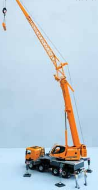
Swingaway boom extension attached

The crane functions all work well, and the model offers a good variety of display possibilities. It can be obtained from the Liebherr web shop for €115 which is very good value considering the detail provided.