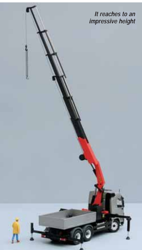
It reaches to an impressive height

To read the full review of this model visit www.cranesetc.co.uk