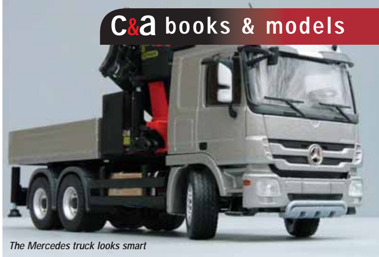
The Mercedes truck looks smart