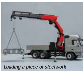
Loading a piece of steelwork