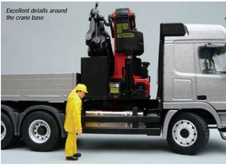
Excellent details around the crane base