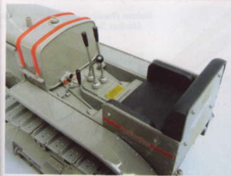
Above: There are excellent controls and a padded seat. Left: The opening engine cover gives access to a detailed engine.

Ian Webb reviews construction models on his website and you can read more at www.CranesEtc.co.uk