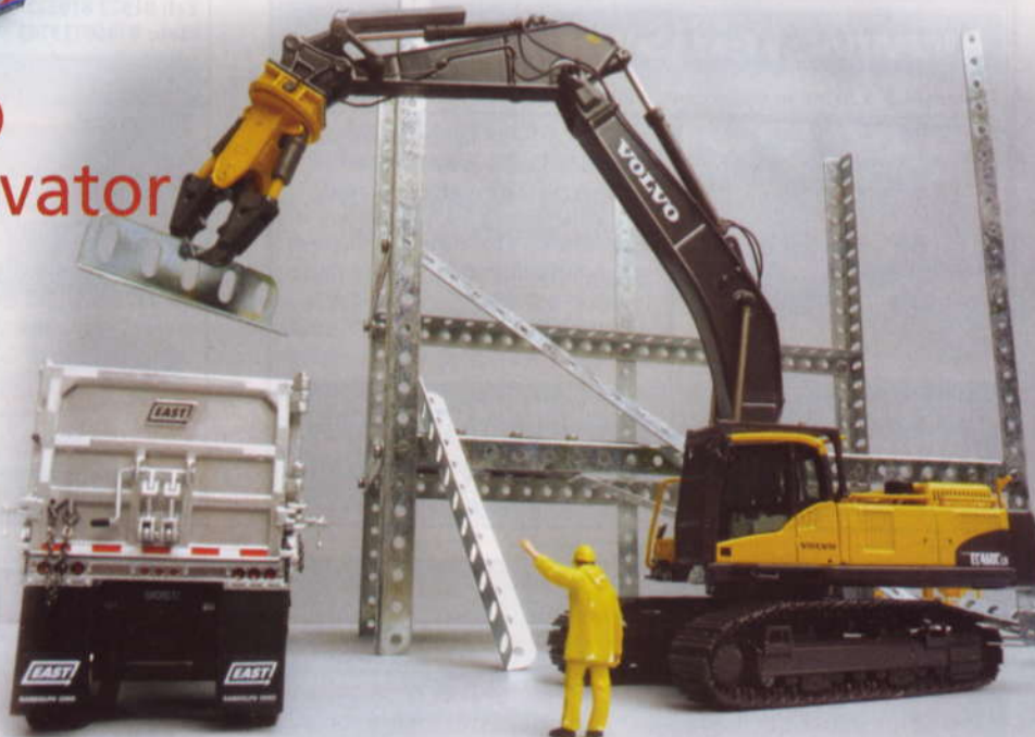
Above: The Volvo EC460CLD at work.

The detail level around the body is very