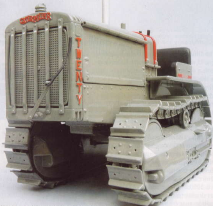
Above: The Caterpillar Twenty is a large model in 1:16 scale.

At the rear, machine notices are printed in exceptionally fine print which is high quality, and there is a towing hitch with