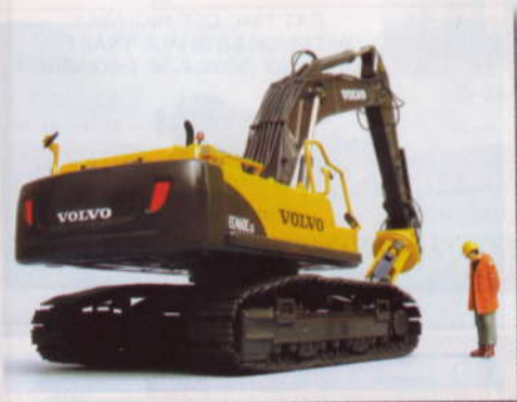
Above: The track frames and body are well detailed.

The Volvo EC460CLD is one of the larger demolition machines in the Volvo range and it has an operating weight of just under 50 tonnes. It is specially strengthened and protected to work in a demolition environment.