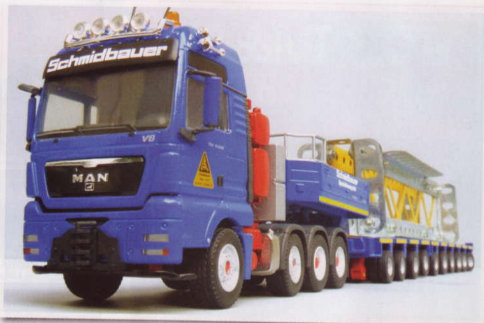
Above: The MAN Tractor pulls a heavy girder.

roof aerials. Behind the cab, the equipment stack is very impressive with a detailed cooling fan at the top. The front two axles can be steered a reasonable amount.