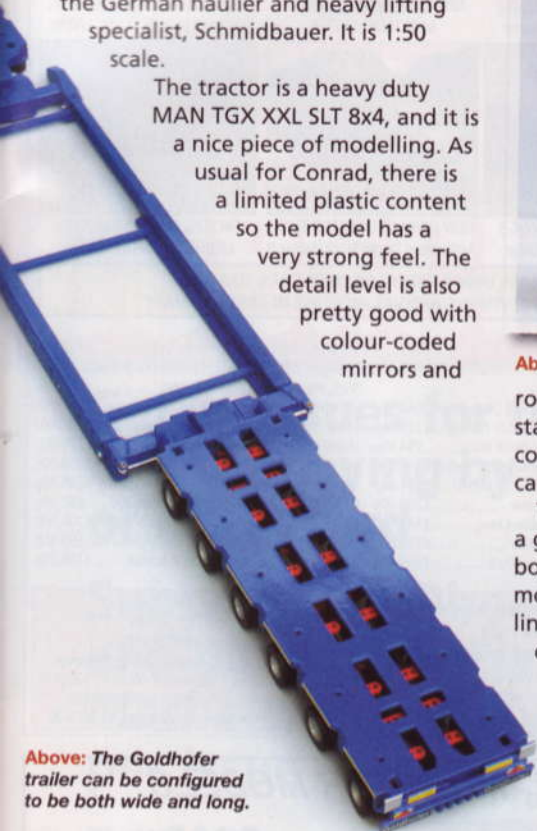
Above: The Goldhofer trailer can be configured to be both wide and long.

The tractor is a heavy duty MAN TGX XXL SLT 8x4, and it is a nice piece of modelling. As usual for Conrad, there is a limited plastic content so the model has a very strong feel. The detail level is also pretty good with colour-coded mirrors and