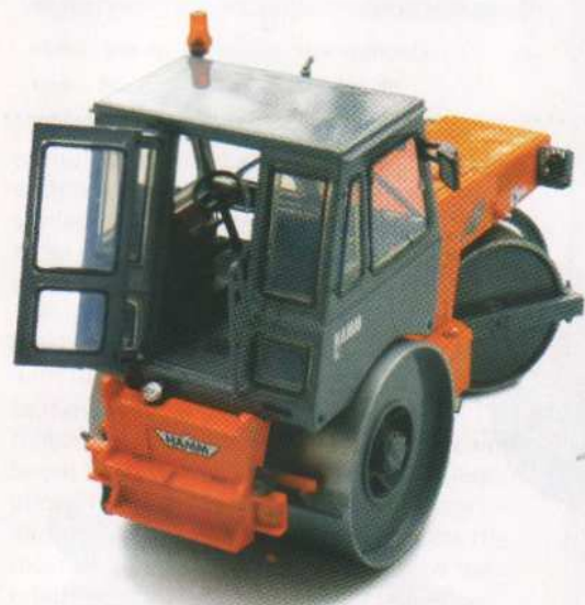
Left: The opening rear access door on the Hamm.

This is a very nicely-detailed model which is up to the standards of other Hamm replicas. It is very good value at around £50.