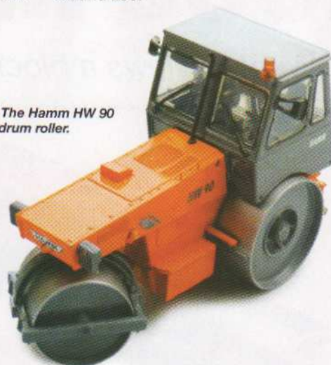
Right: The Hamm HW 90 three-drum roller.