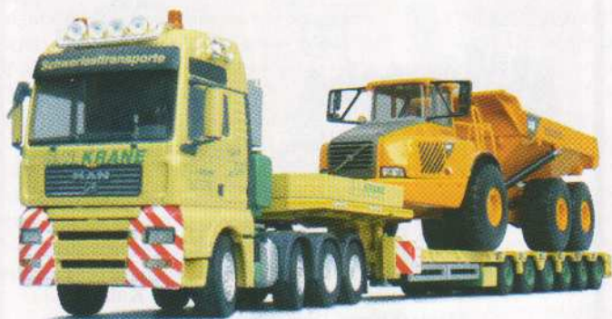
Above: The Goldhofer looks great carrying a load such as the Volvo A40D.