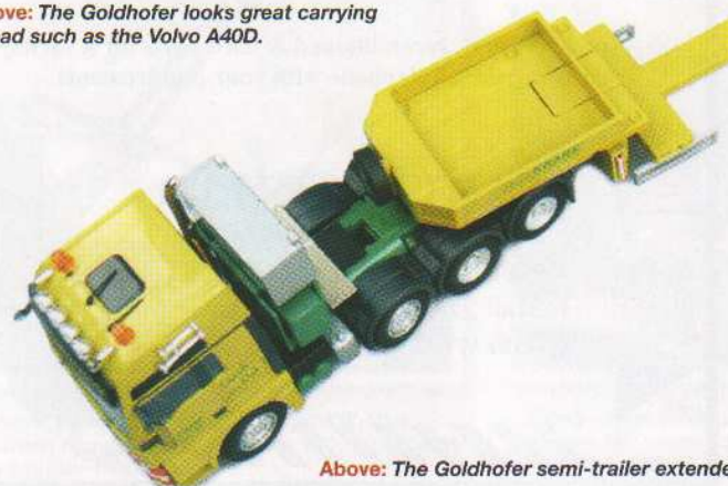
Above: The Goldhofer semi-trailer extended out.