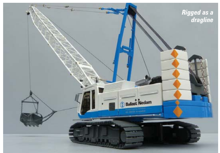
Rigged as a dragline