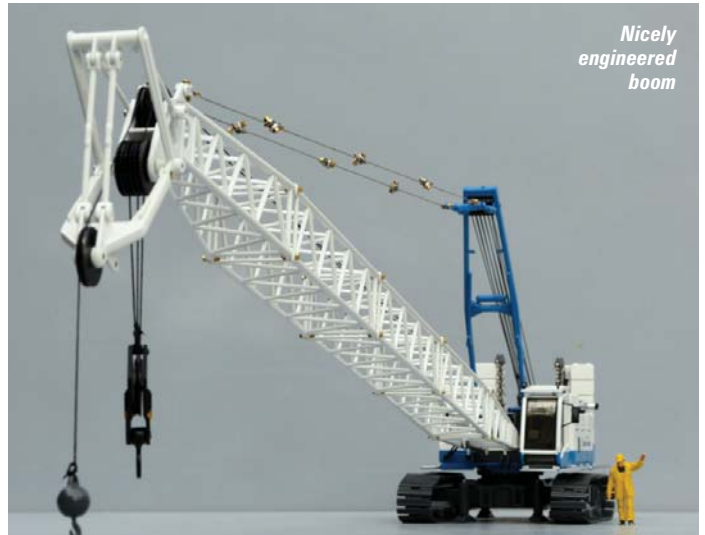
Nicely engineered boom