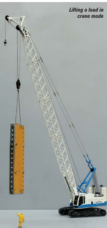
Lifting a load in crane mode