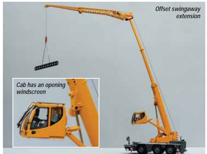
Offset swingaway extension