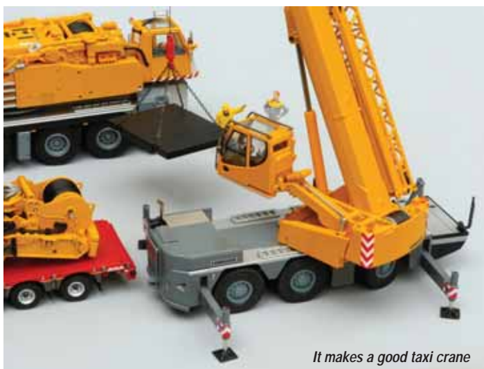
It makes a good taxi crane