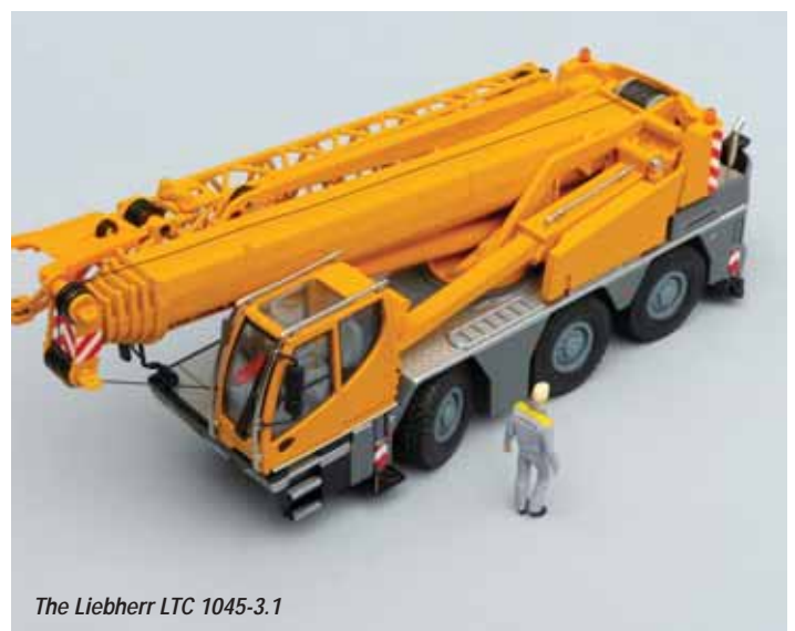
The Liebherr LTC 1045-3.1