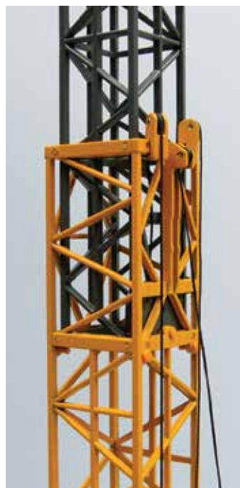
Mast raising system is modelled