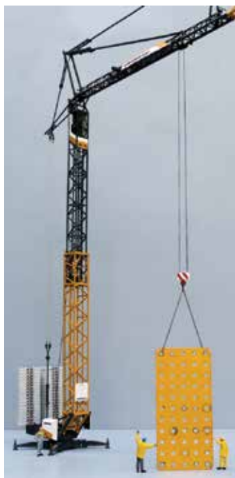
Lifting a panel