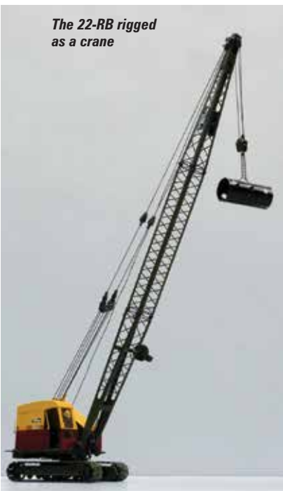
The 22-RB rigged as a crane