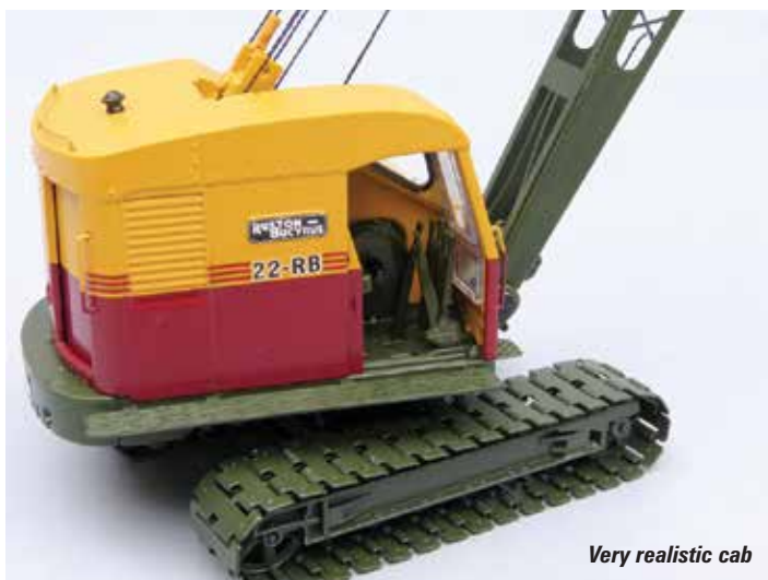
Very realistic cab