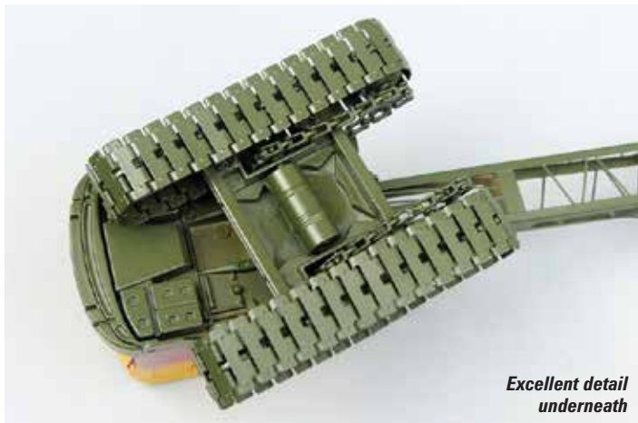
Excellent detail underneath