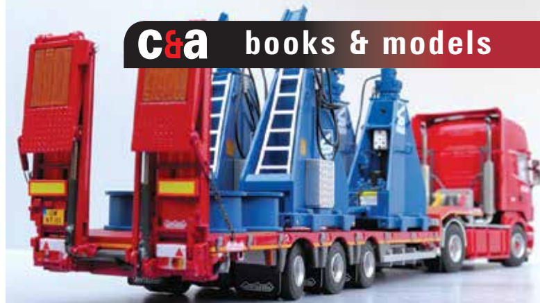
The parts as a haulage load