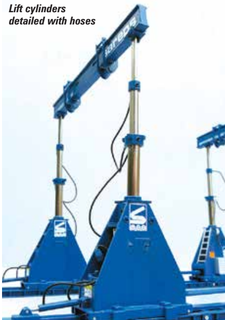
Lift cylinders detailed with hoses