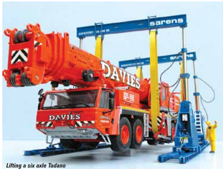
Lifting a six axle Tadano