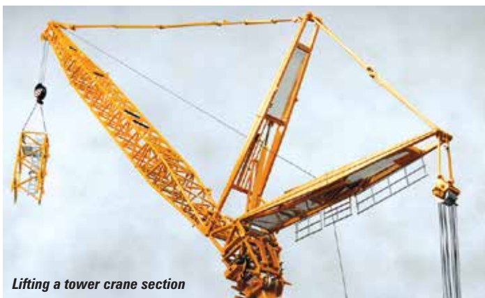
Lifting a tower crane section