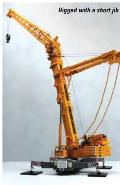
Rigged with a short jib