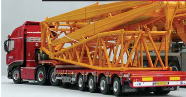
Luffing jib pivot as a load