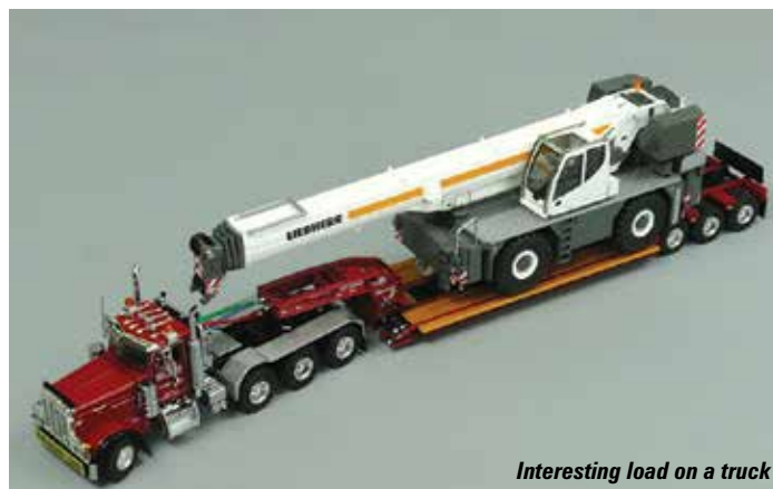
Interesting load on a truck