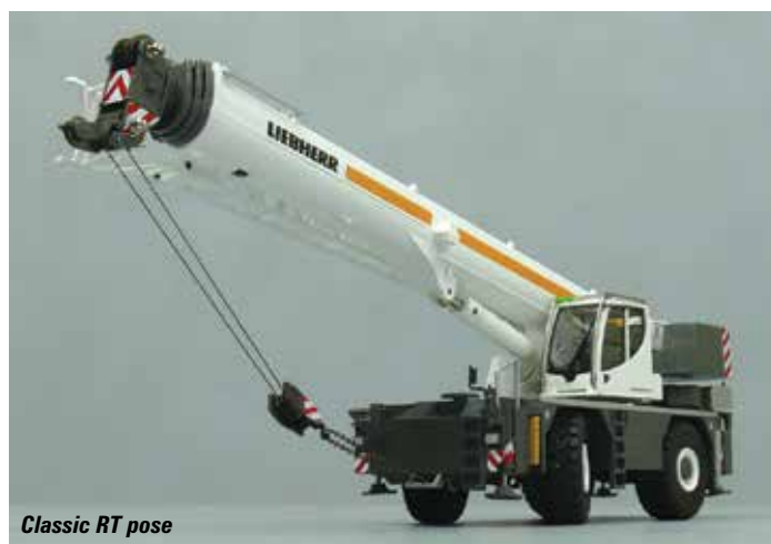
Classic RT pose