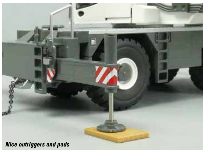
Nice outriggers and pads